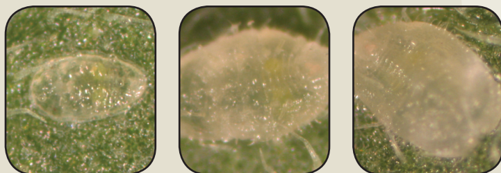
Untreated whitefly nymphs