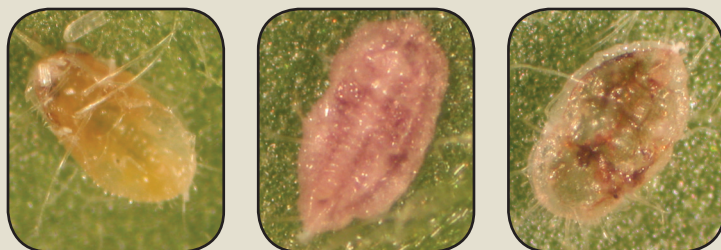
BotaniGard - treated whitefly nymphs