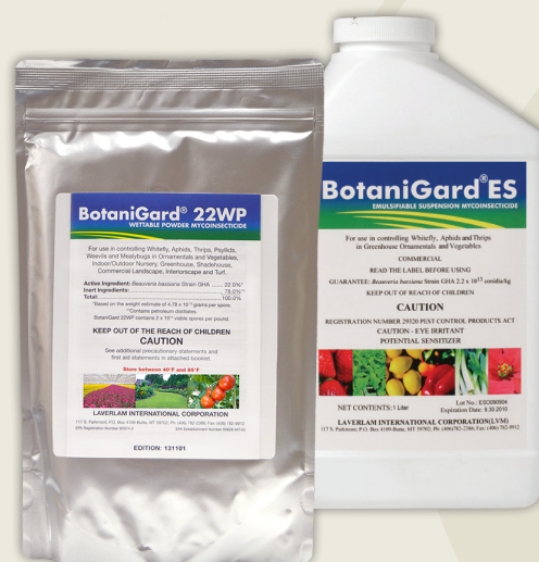
Size: 500 grams (WP) and Size: 1 litre (ES)